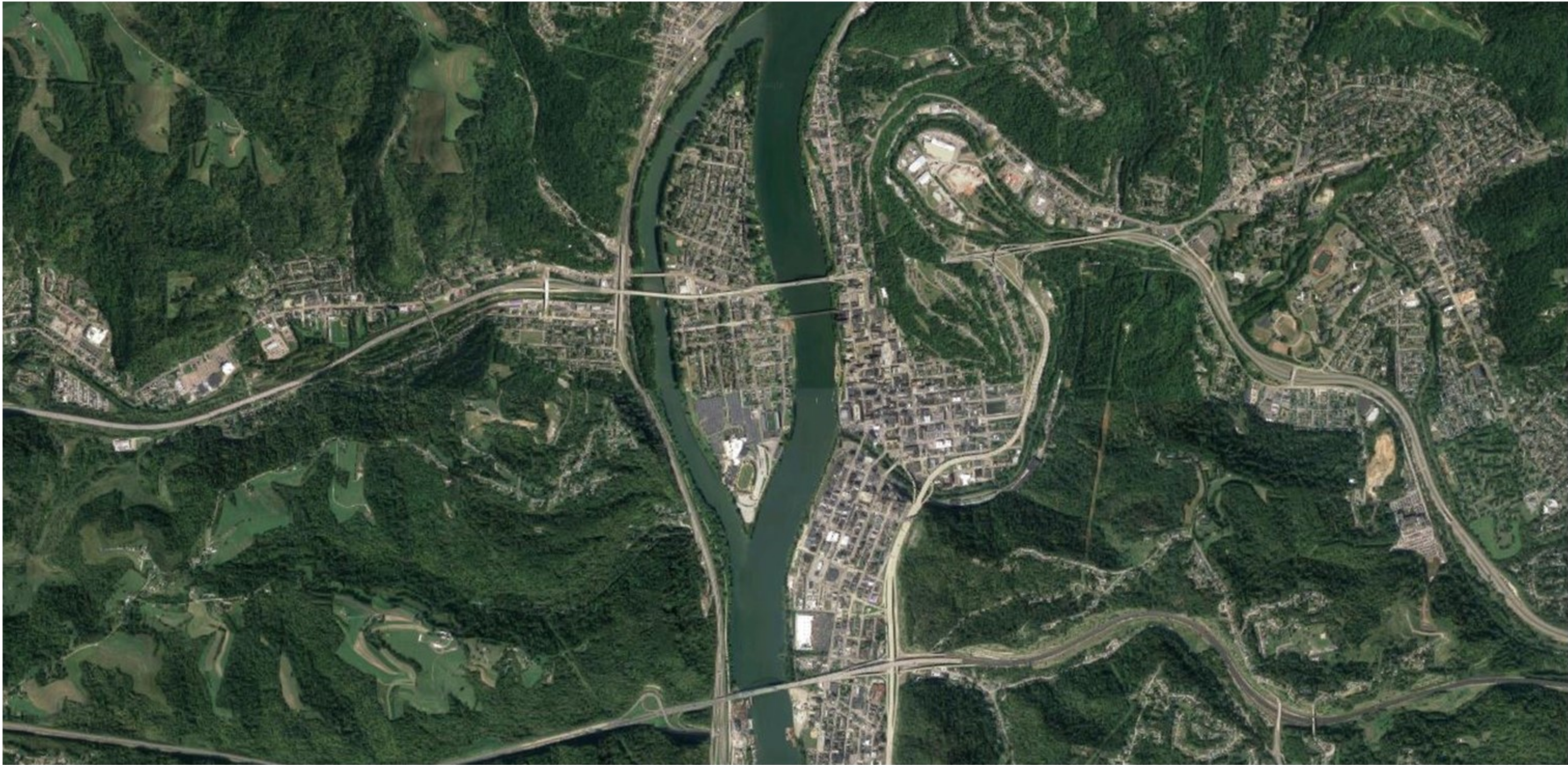
US 40, Rt. 7, Rt. 2, I-70, I-470, Main Street