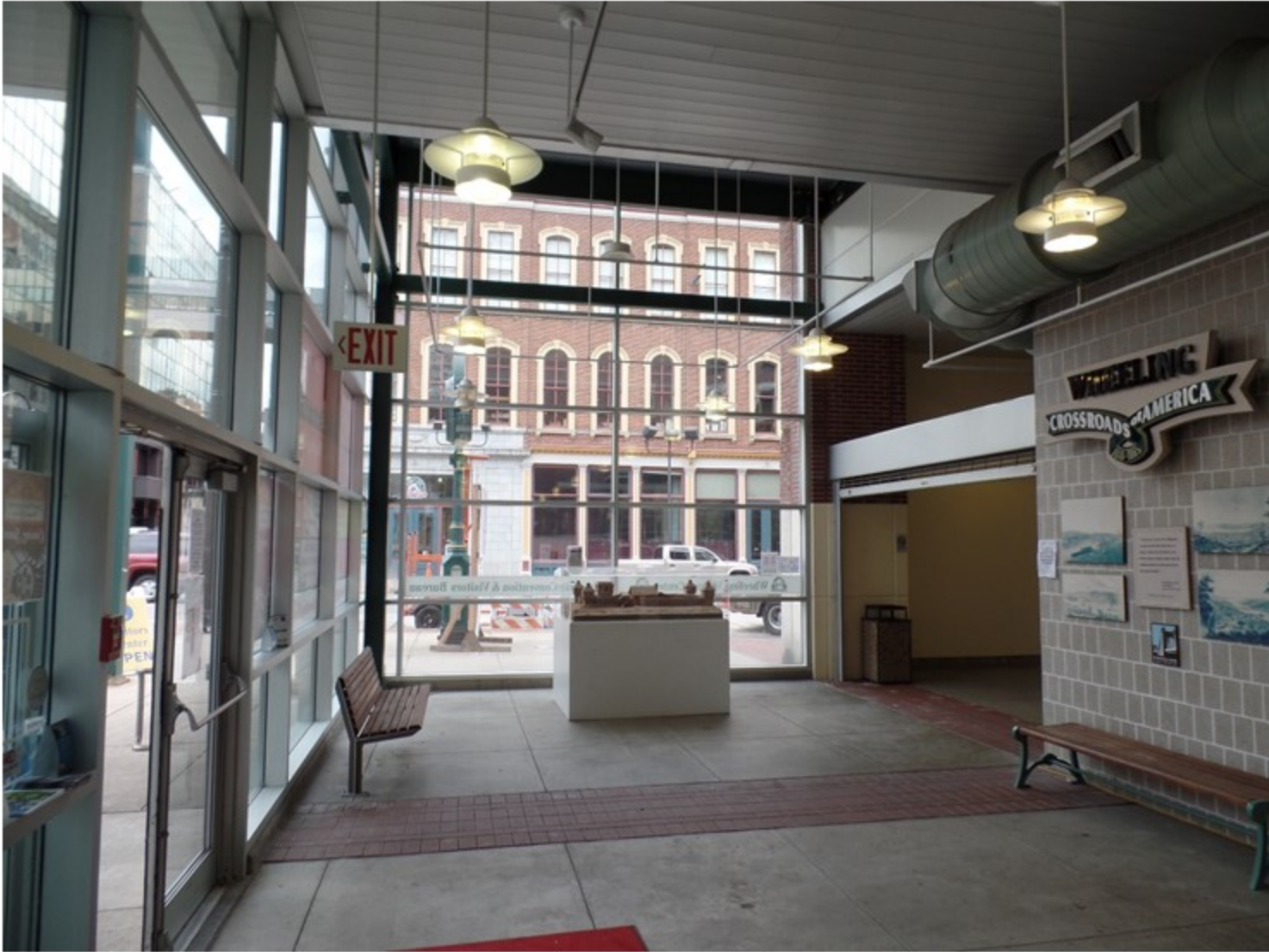
View from CVB space