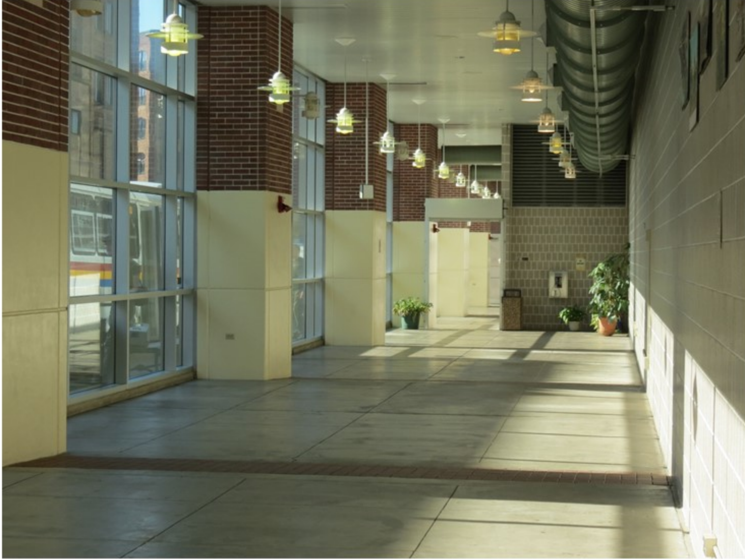
View to the South – Proposed Market Floor