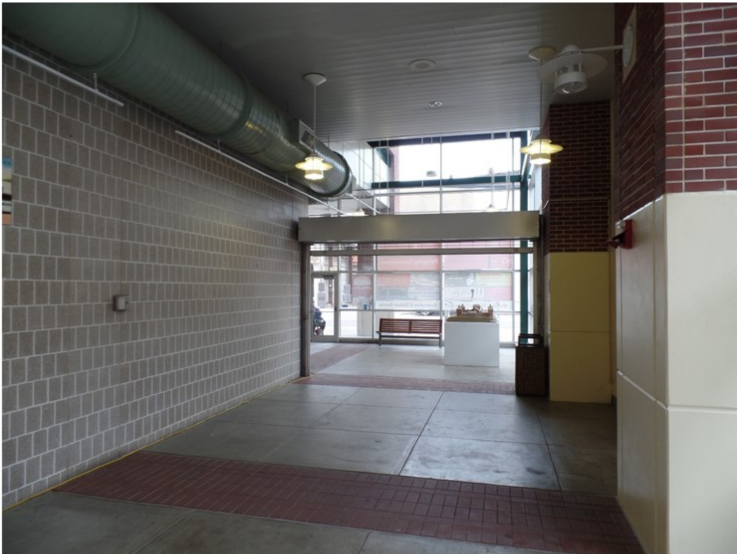
Proposed Point of Sale