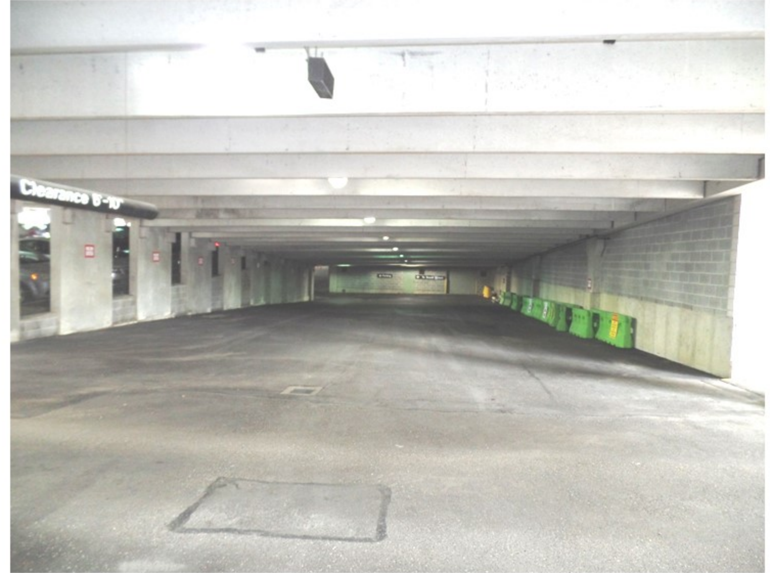
Lower Parking Level – Back of House Storage