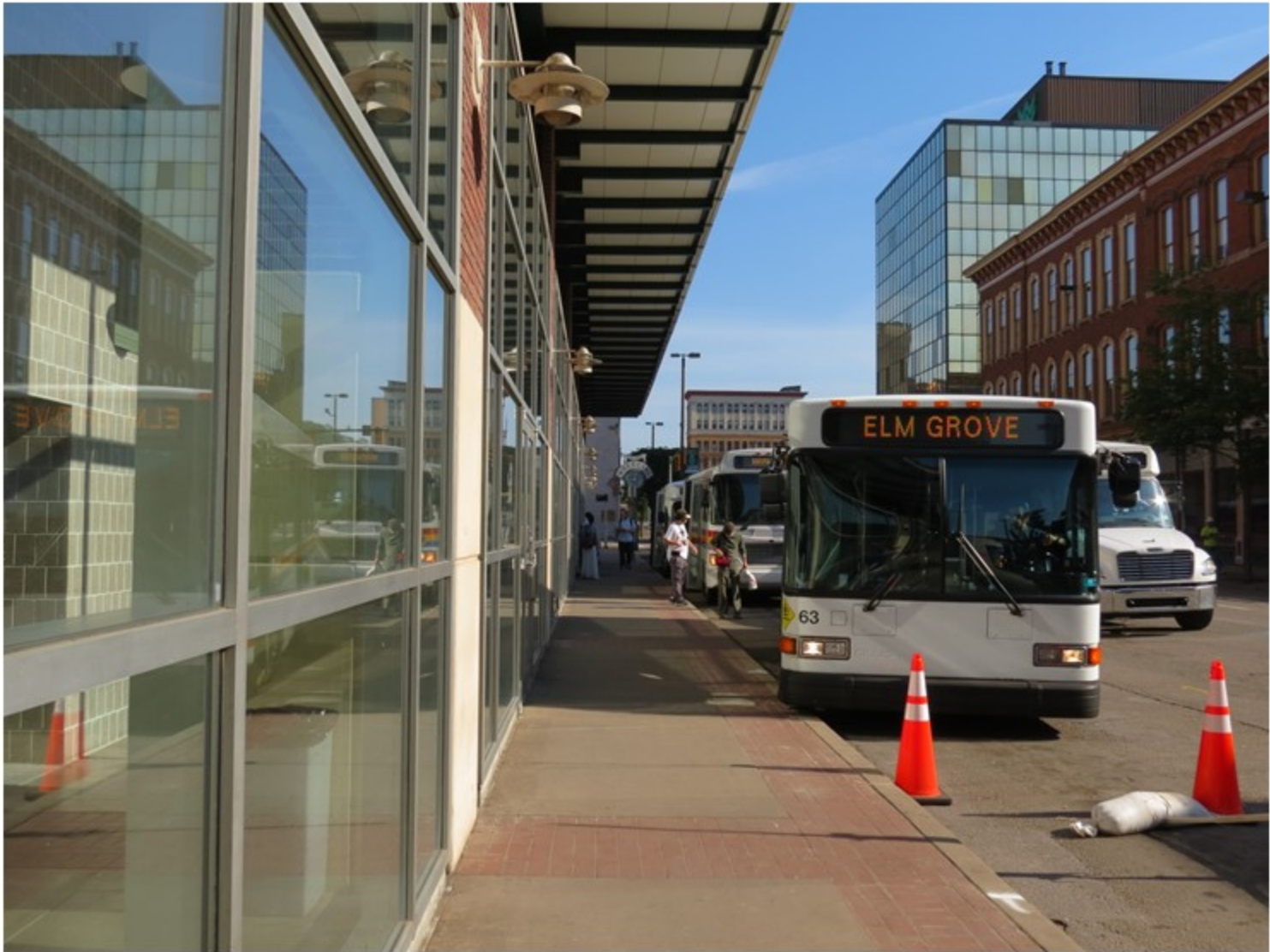
Main Street Bus Line – Entry