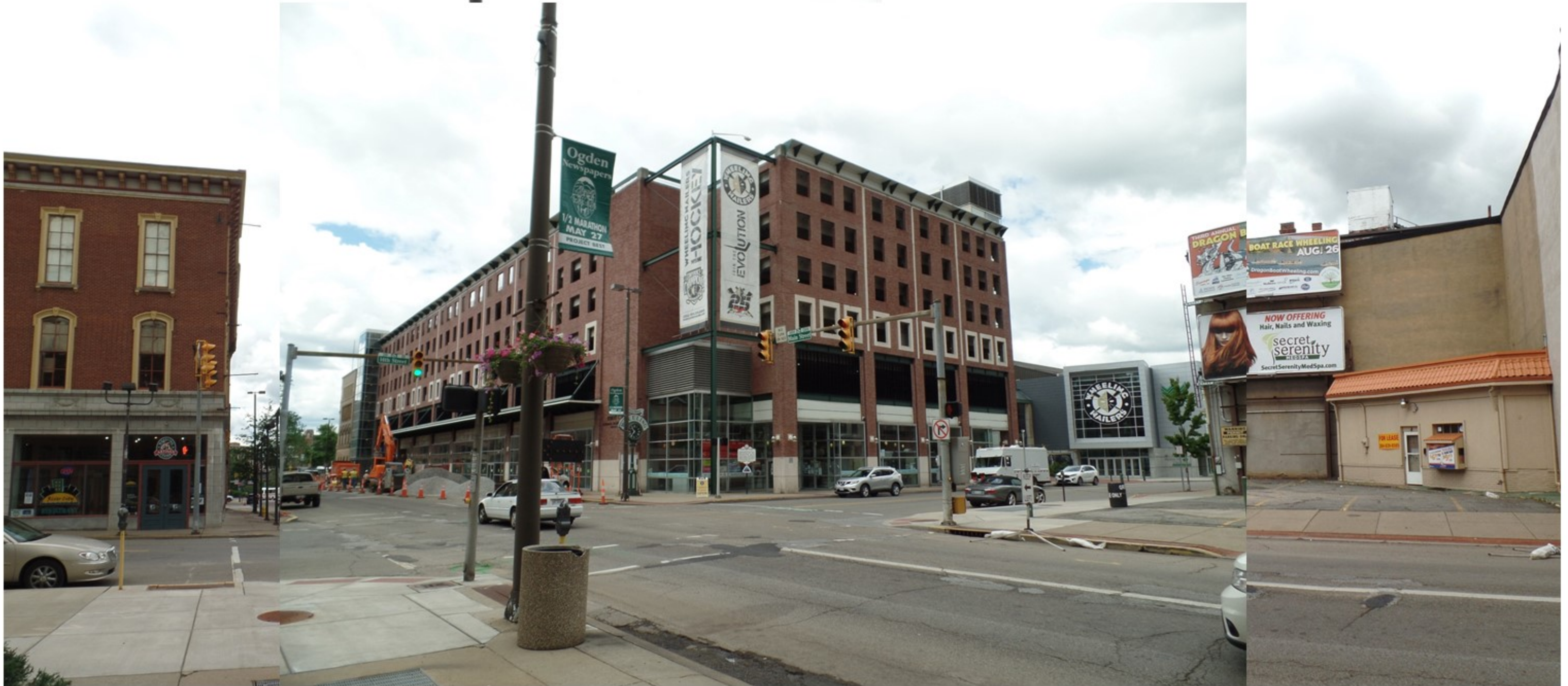
14 th & Main Street – Artisan Center, Intermodal Center, Wesbanco Arena & Heritage Port