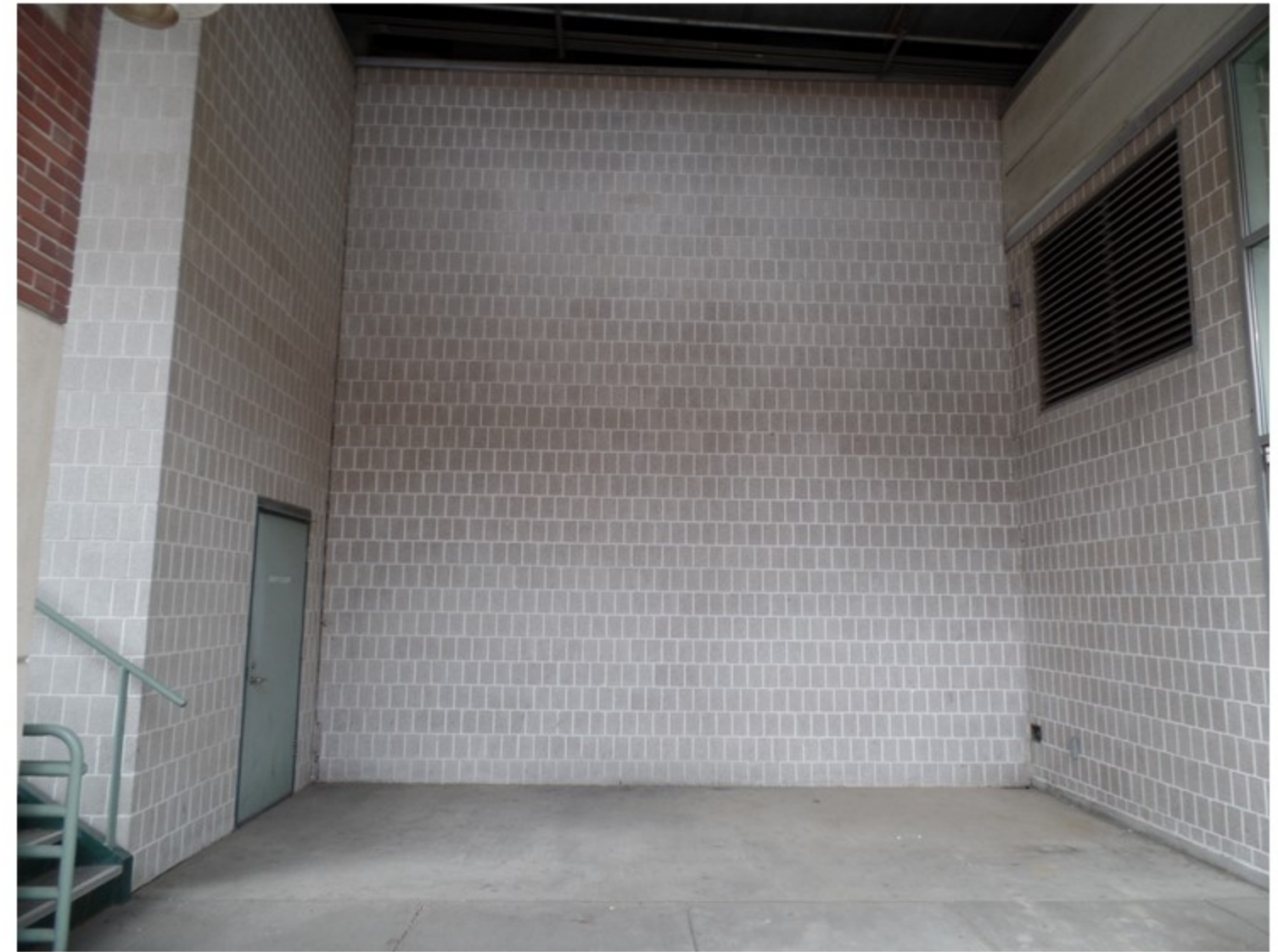
Connection to Back of House