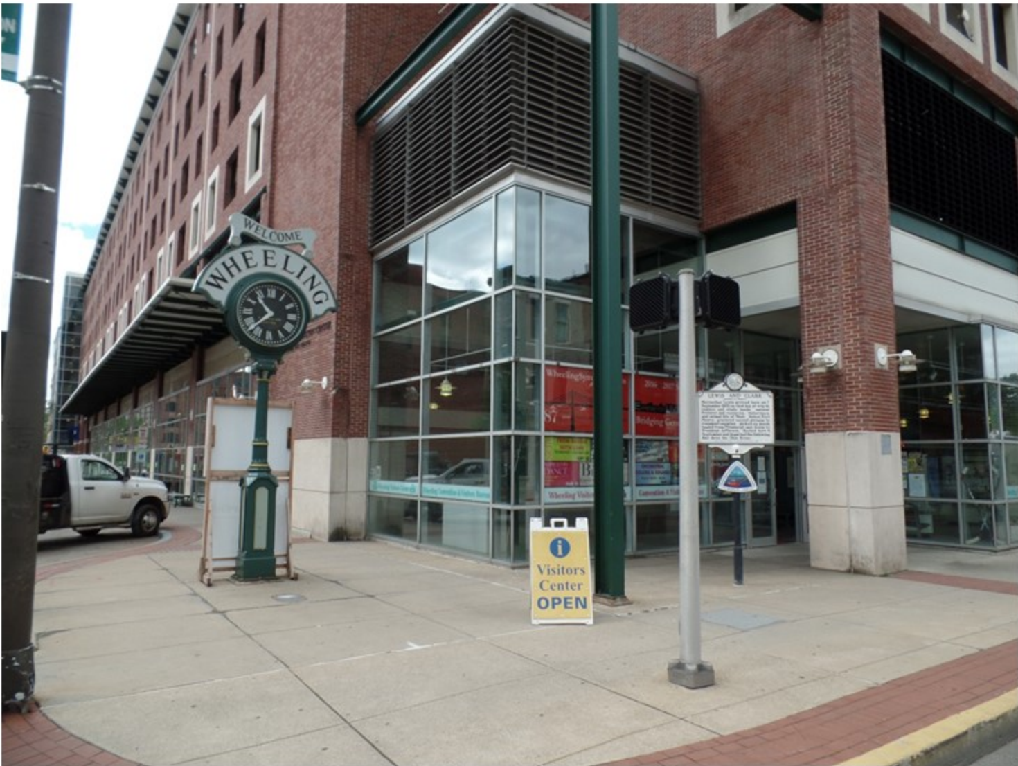
14 th & Main Street – Entry & Seating