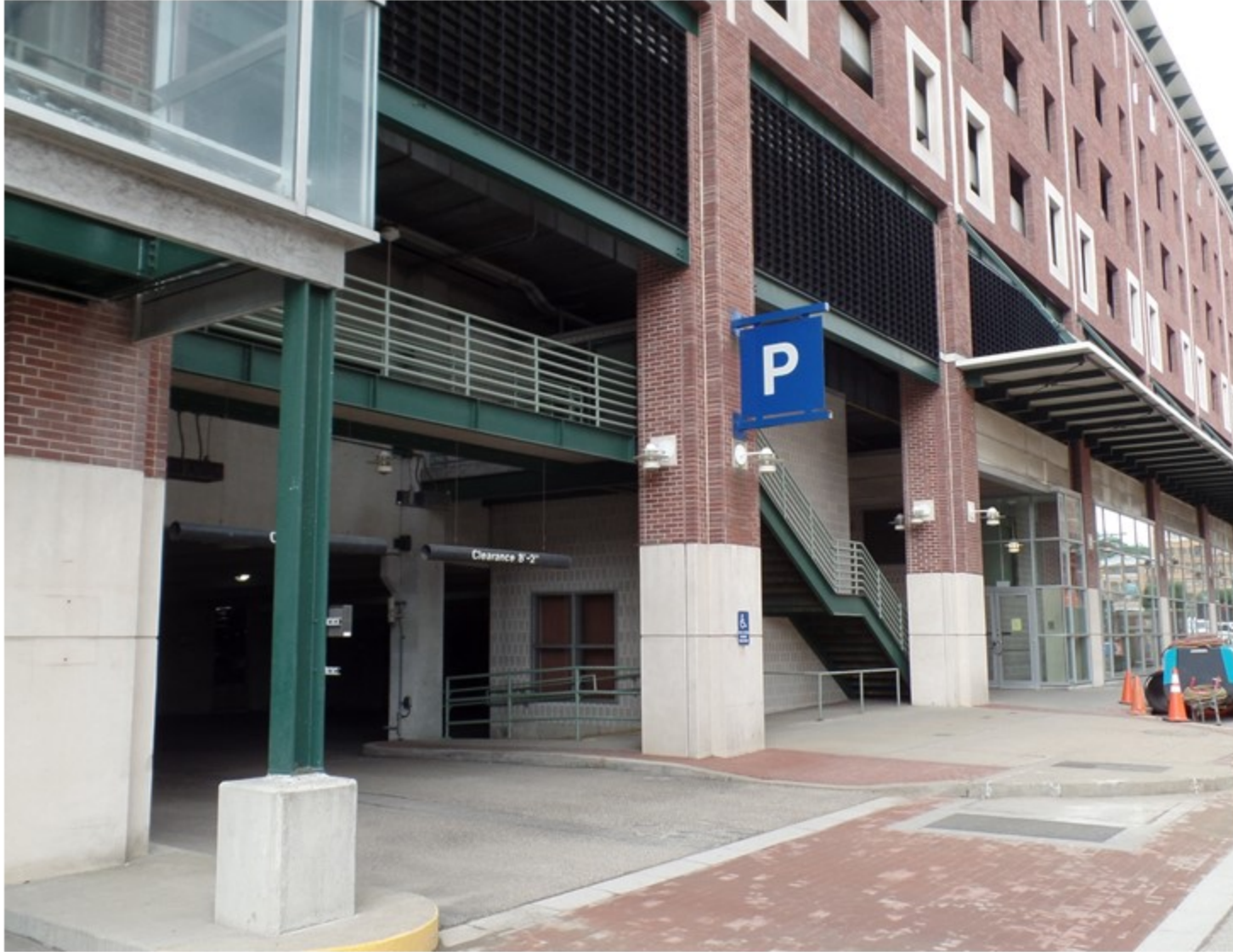
South East Garage Entry – Service & Office