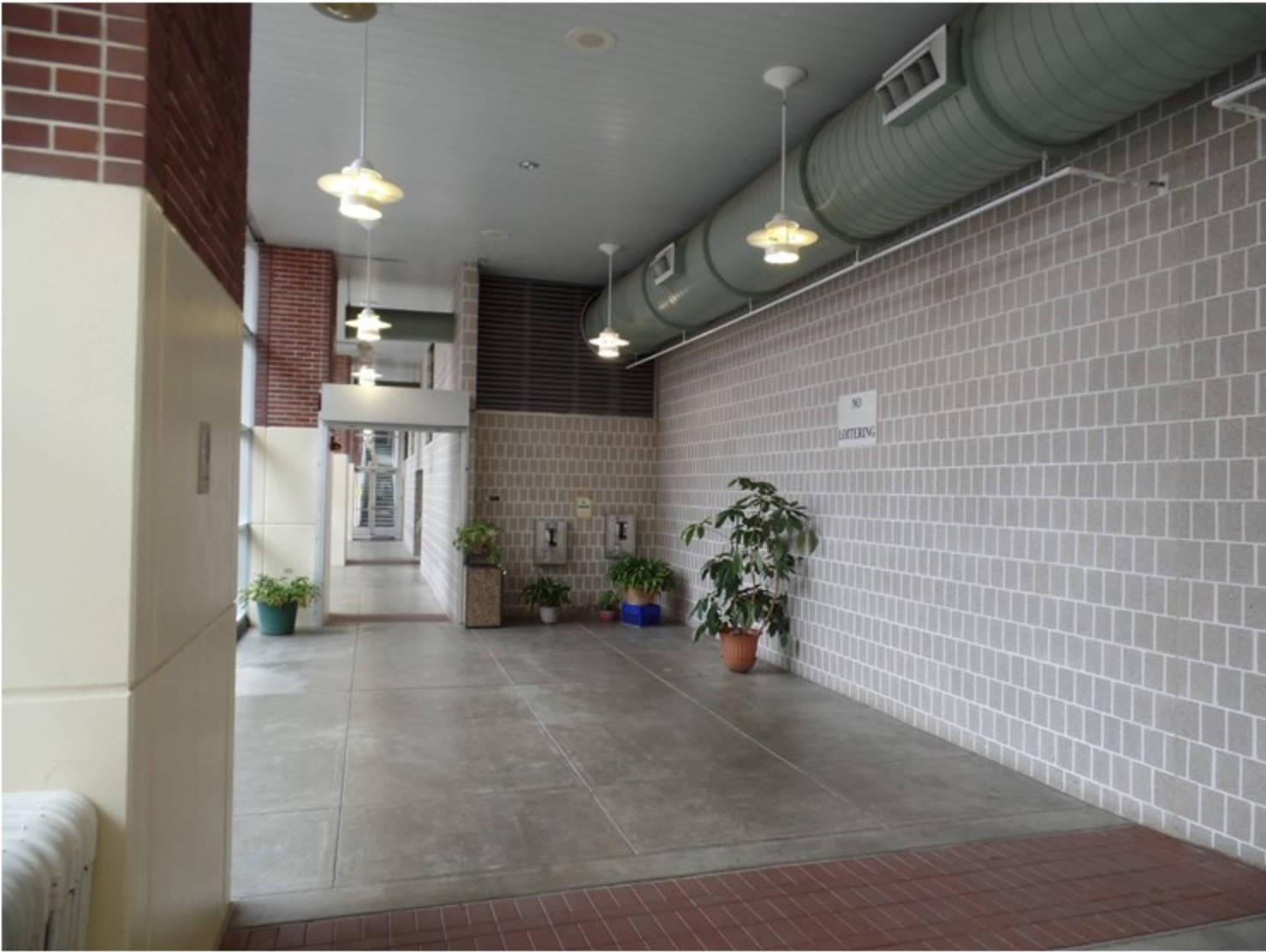
Proposed Deli Space