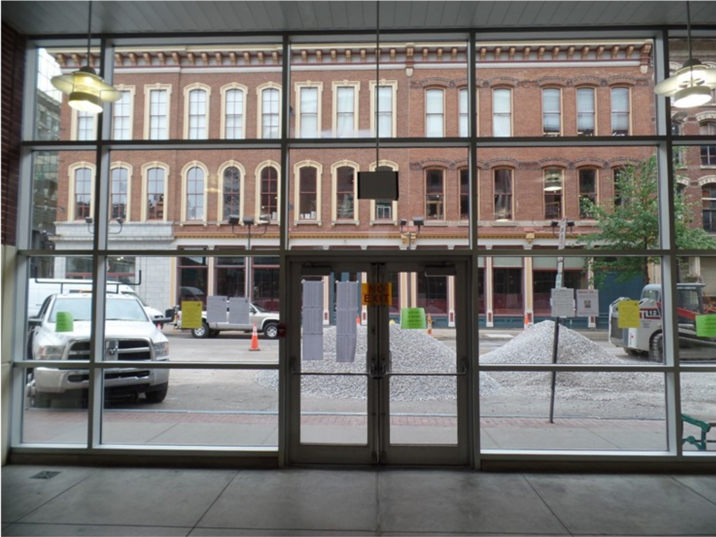
View to Main Street