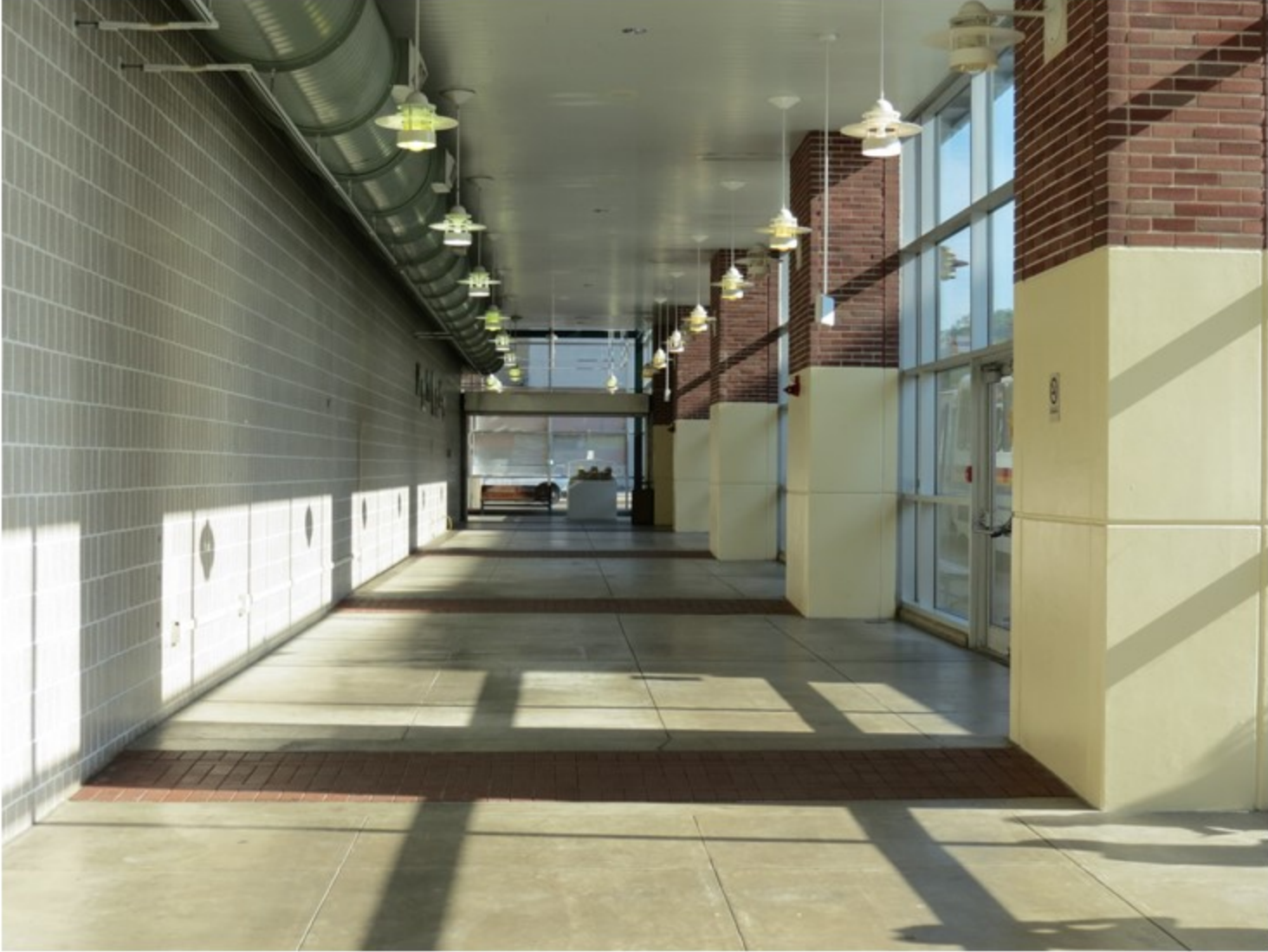
View to the North – Proposed Market Floor